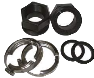
Seametrics Fitting Kit for 2 & 3 inch model